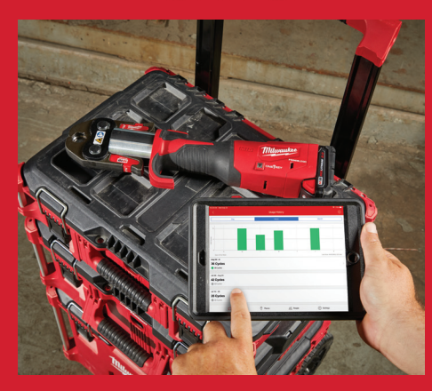
WIRELESS VERIFICATION OF SUCCESSFUL PRESSES ON A MOBILE DEVICE