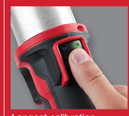
Longest calibration interval, 50,000 cycles