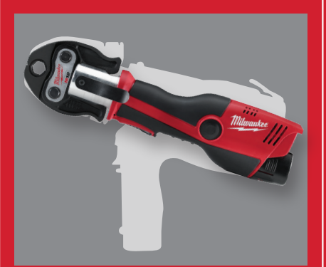
Lightest, in-line design for unrivaled access