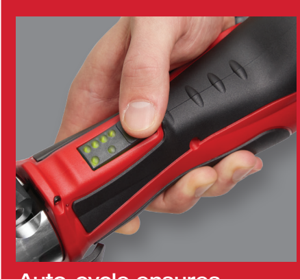
Auto-cycle ensures full press every time