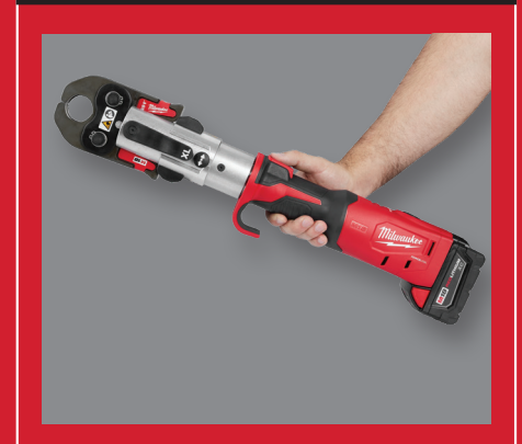
Lightest, in-line design for unrivaled access