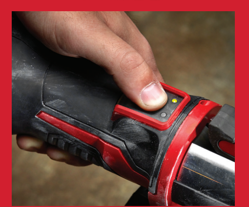
AUTO-CYCLE ENSURES FULL PRESS EVERY TIME WITH A GREEN LIGHT VERIFICATION