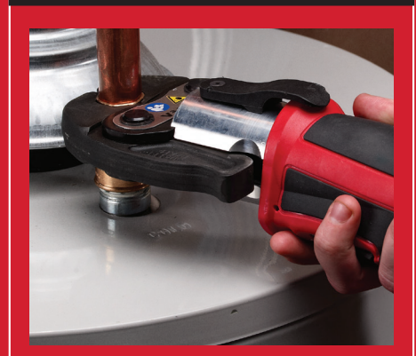
Easy open jaw for one-handed use