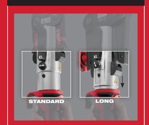
Adjustable stroke for optimized cycle time