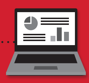
ONLINE + MOBILE RECORD KEEPING